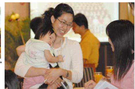
▲ "My daughter is kind of shy."