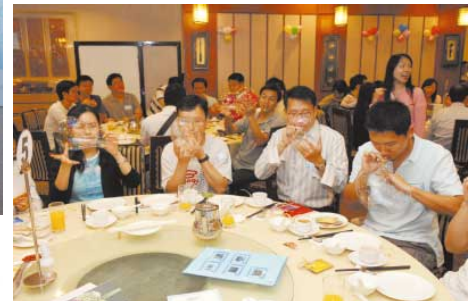
▲ Everyone was busy blowing a balloon.