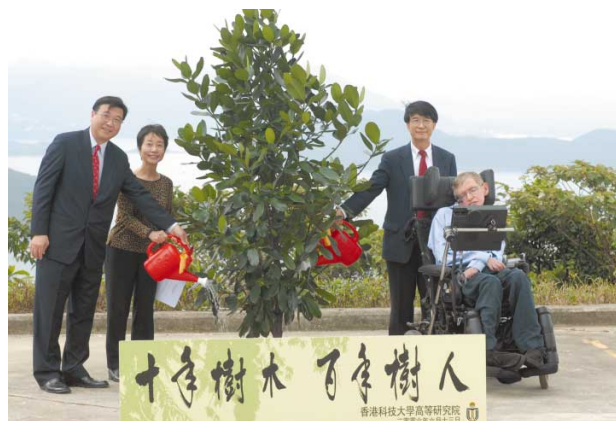
In June 2006, Prof Stephen Hawking visited the future site of the IAS and took part in the tree planting ceremony

The IAS will be located on the site previously occupied by Shaw Studio, adjacent to the existing campus. The expected completion date of the building is 2011.