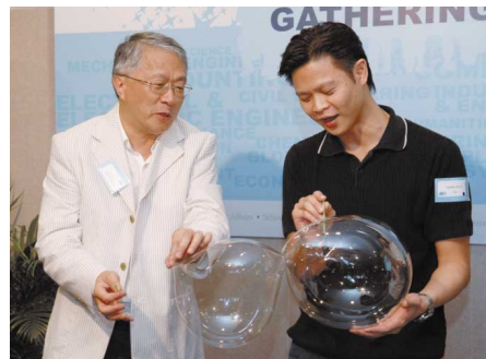
▲ "Which is bigger?"