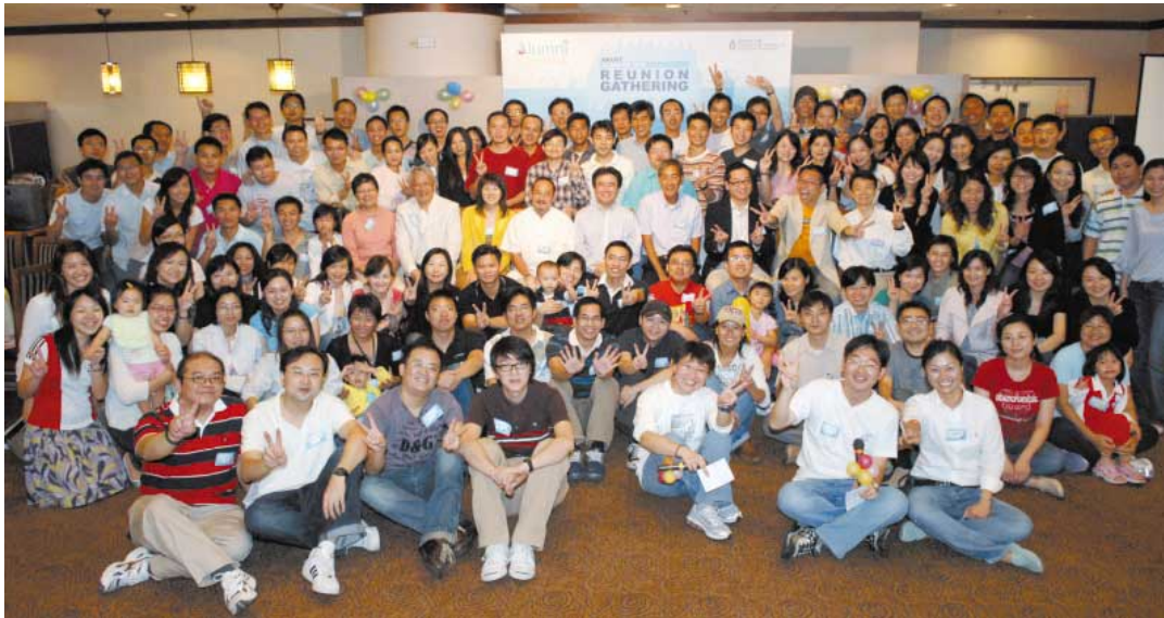
◀ Smiles from everyone.