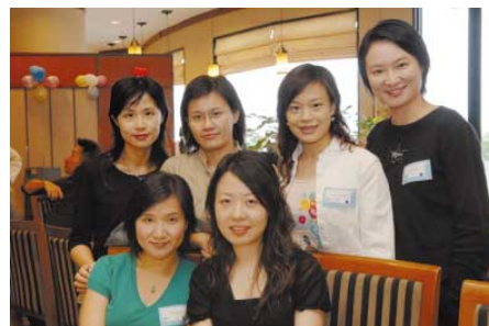
▲ "Let's take a nice picture together."