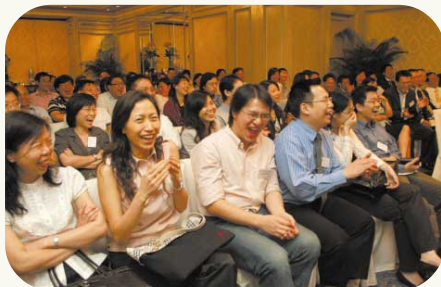
Laughters from the MBA Alumni Forum (26 July 06)