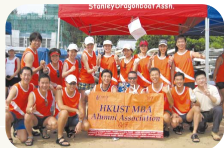
Dragon Boat Practice & Races 2006 (April - June 2006)